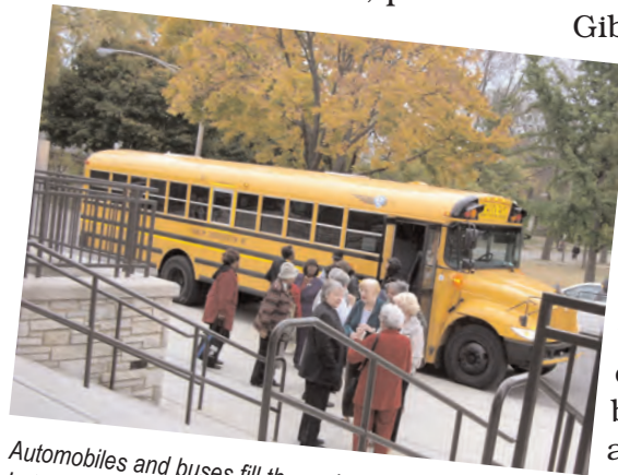
Automobiles and buses fill the parking lot of St. Paul Lutheran Church in Mt. Prospect, IL.