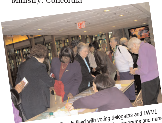
The narthex of St. Paul is filled with voting delegates and LWML members and guests registering and obtaining programs and name tags. Nearly 400 LWML members and guests soon filled the sanctuary.

While beginning the day with the “all too needed cup of coffee,” everyone was able to browse and make purchases from the various display booths represented by Thrivent, Lutheran Bible Translators, Jews for Jesus, Gospel Outreach, Multi Culture Ministry, Concordia