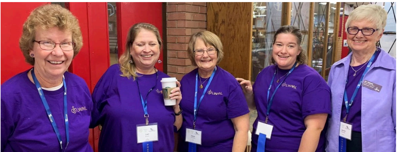
LWML NID Representatives at the NID's 2023 Educator Conference

To learn more about LWML NID Mission Grants, visit https://lwmlnid.org/mission-grants/ .