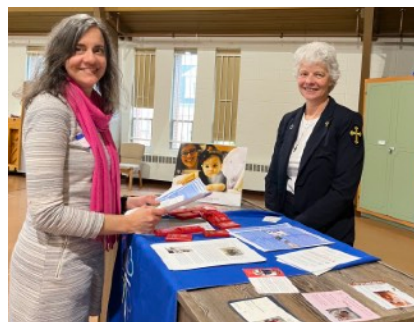
Zone 7 also above right