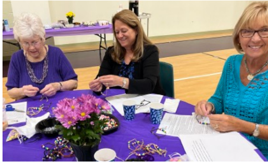
Left: Zone 1