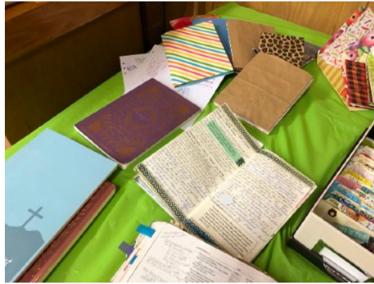
Scripture journaling samples