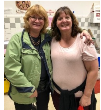
Serving Joy at Our Savior Carol Stream

What a gift our time of waiting is, as more step forward to help and serve. I think of Psalm 139 and the image of our being knit together in a secret place—of God knowing each day of our lives before we were even born. God already knows exactly the time and place of the "birth" of this new home and has each day planned out for each resident and her precious baby. How He has planned each of our days and our coming together to pray for and support this new home with our time, talents and treasures is all part of His plan. It is all a good and perfect gift from God. Let us celebrate the anticipation in thanks and great wonder as He continues knitting. May we each pray about how we might help and then step forward boldly in faith in God's promises.