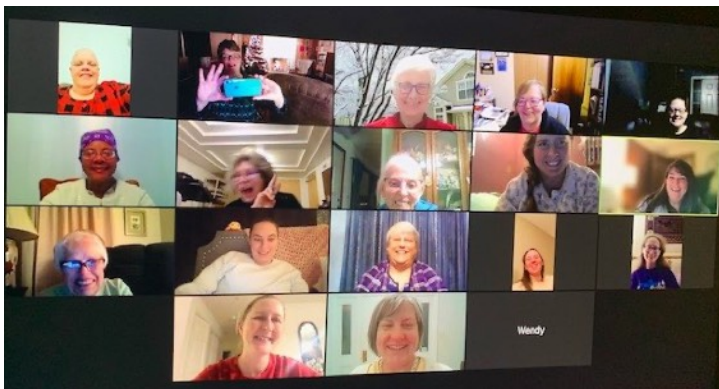
2022 Winter Retreat Participants

The Young Women continue to pray for and with each other. If you would like to be a part of that praying group or have a prayer request, email ywchairman@lwmlnid.org . We are the women that God has made! We will rejoice together!