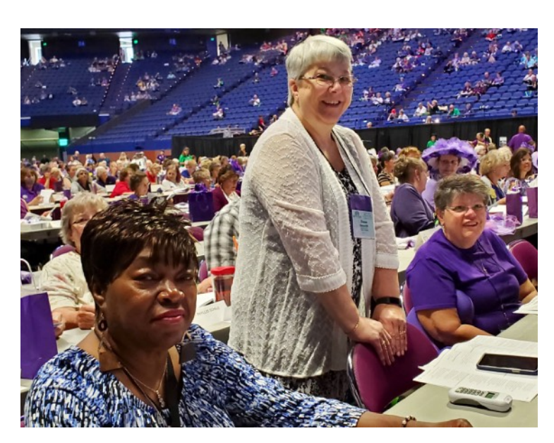
NID Delegates in Lexington

"Take it to the Lord in prayer..." — that's what everyone did, and God answered with a resounding "YES!" Our LWML was the first organization to host a convention in Lexington, KY, since the beginning of the pandemic! How did the members respond? 2,792 attended in person and over 3,800 more live-streamed some or all of the