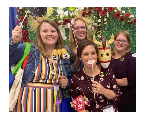
YWRs Having Photo Booth Fun!

The YWRs are ready to come down from this mountain top experience and go into the valley. The work of the LWML is done in the valley and our YWRs are ready to work. Let us all warmly welcome them and work by their sides. Most importantly, let us all pray with them and for them. To God be the Glory!