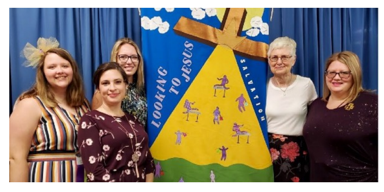
NID's President & YWRs with the District Banner