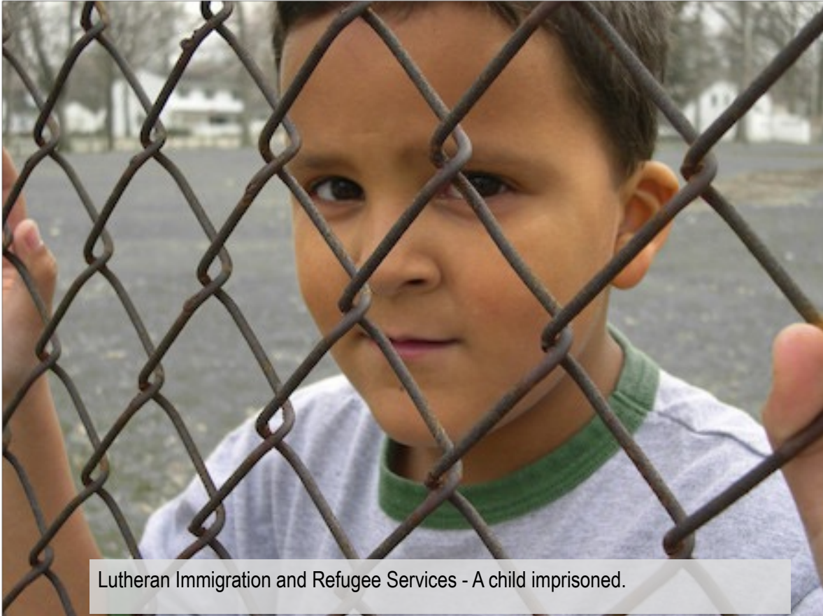
Lutheran Immigration and Refugee Services - A child imprisoned.