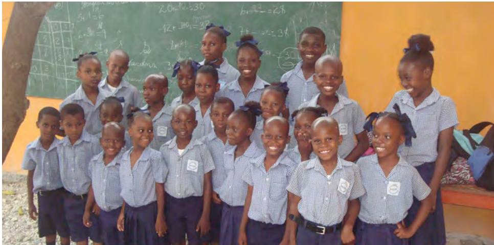
House of Love Orphanage/The Haiti Lutheran Mission Society LWML NID was able to partially fund this grant. See page 5.