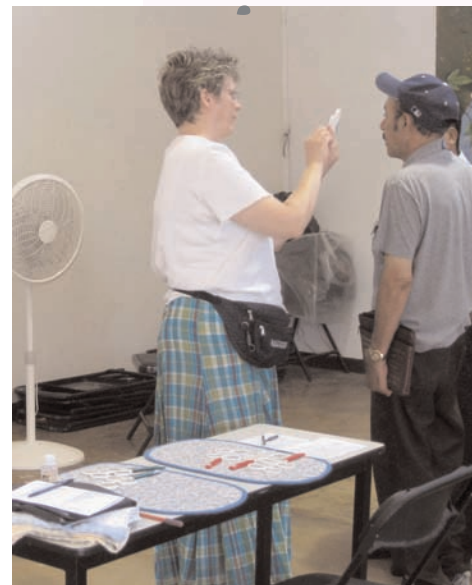
Testing Eyes for Distance in Mexico

Yes, I am a mission team member, a daughter, a mother, a wife, etc. etc. But there is a role I have that is much more important than all the other roles put together. I am a child of God. I am created by God the Father, forgiven by the death and resurrection of God the Son, and sanctified by God the Holy Spirit. My purpose in life is to praise our God and to share the wonders of His love with others. Nothing else really matters. My life is held